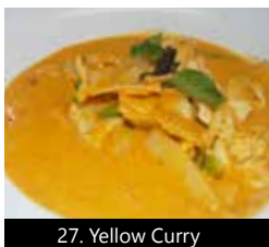
27. Yellow Curry