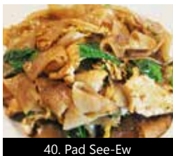
40. Pad See-Ew