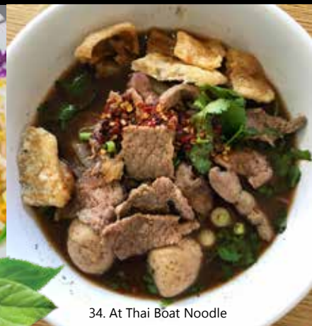
34. At Thai Boat Noodle