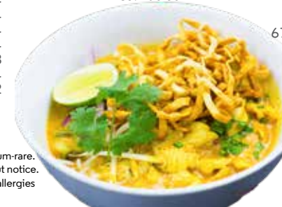
59. Kao Soi