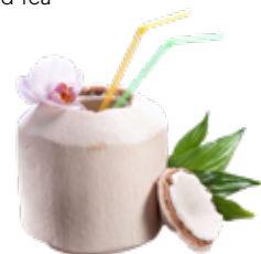
Fresh Young Coconut