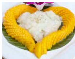
Mango with Sweet Sticky Rice