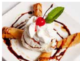
Ice Cream with Fried Banana