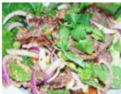
23. Num Tok