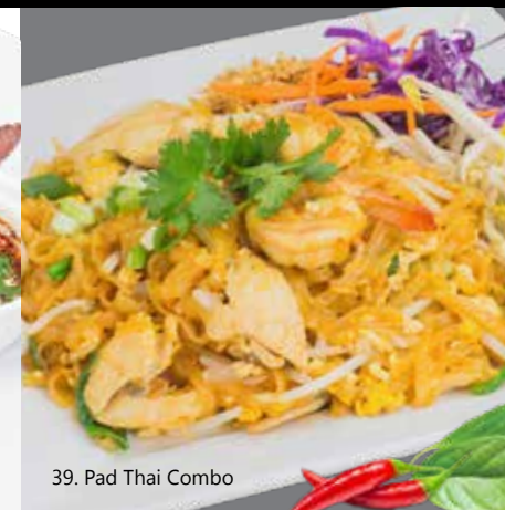
39. Pad Thai Combo